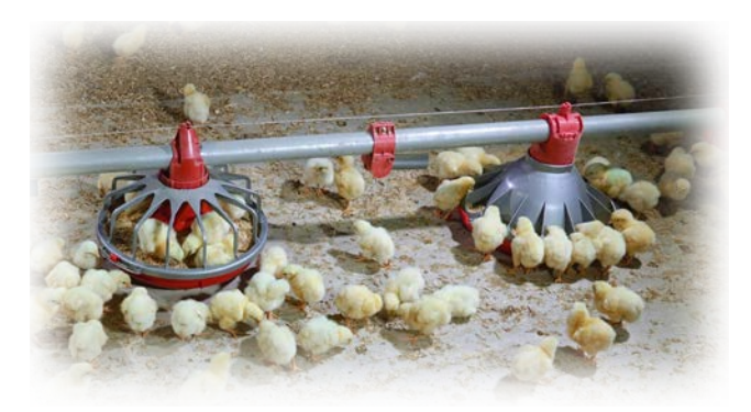
Three Days Old

Birds naturally tend to eat from outside of the KONAVI® Feeder. The benefit is reduced feed contamination. Young birds may climb up on the feeder, but they typically do not stay there long. Most importantly, they are inclined to face inward toward the feed so most droppings fall outside the pan.