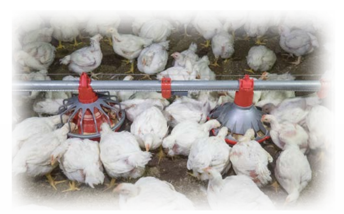
Adolescent birds may still climb inside grilled feeders. They block access to feed for other birds and contaminate the feed with their droppings.